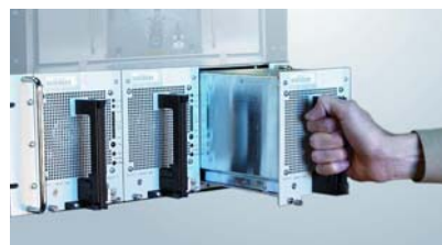
The modular power supply is N+1 redundant.