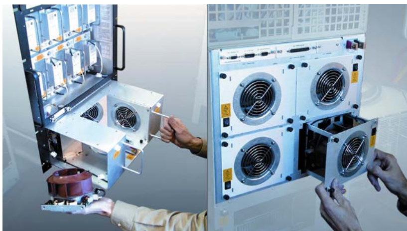
Modular intake and exhaust fans maintain 400 cfm (0.189 m 3 /s) volumetric air flow.

ModuMAX also incorporates redundancy into its integral forced-air cooling system. Enough margin is built into the design to tolerate the loss of one cooling fan. Fans are monitored for rotational speed, and failure of a fan is indicated on the control panel display. In the event of a fan failure, the SSPA can continue to operate until a replacement is installed. The air cooling system utilizes separate rear panel air intake and exhaust ducts and can be vented either outdoors or into the room.