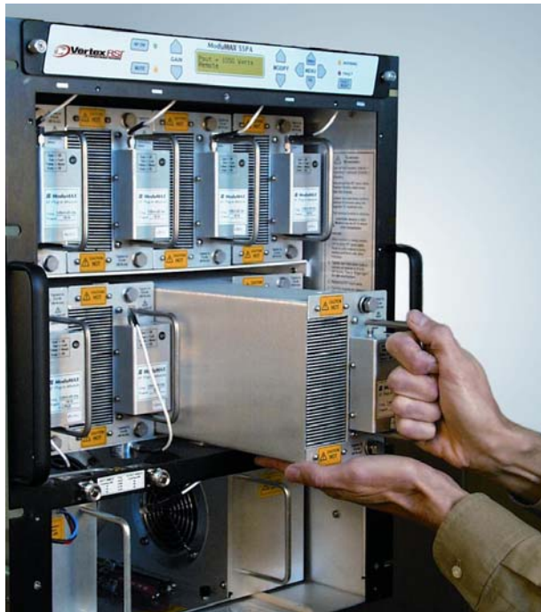
Interchangeable RF modules can be hot-swapped for fast and easy servicing.

Since solid-state power amplifiers (SSPAs) consist of multiple transistors in parallel, they naturally contain a degree of built-in redundancy. With proper attention to design architecture, the use of multiple parallel RF modules, and the elimination of all active devices from the common RF path, VertexRSI has designed an SSPA that is reliable and extremely fault-tolerant. With the ModuMAX series, one fault-tolerant SSPA can replace two power amplifiers for a huge savings in installation and operating costs.