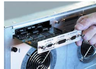
Modular, replaceable components assure ease of maintenance.

ModuMAX SSPAs are designed to be easy to operate and maintain. The most commonly used controls are brought out to the front panel for quick and easy access. All features are fully remote controllable through the standard RS-232/-422/-485 and network interfaces. Most servicing can be performed safely while the SSPA continues to operate. Any of the eight fans in the air-cooling system can be easily removed and replaced, all without ever taking the SSPA off-line. Even the power supply is N+1 redundant.